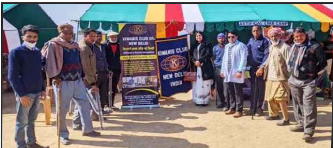
Artificial Limbs distribution at Nowshera -Jammu

This report carries our whole hearted sincere commitment and recommendation.