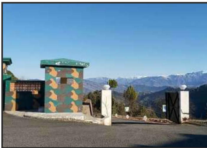
Bimber Gali Brigade